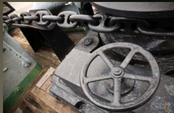
Energy & Marine Maintenance